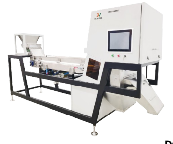
Curious to Know More then contact on given details