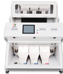
DCS - 3T