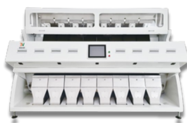
DCS - 8T