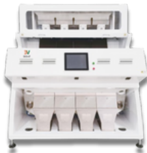
DCS - 4T