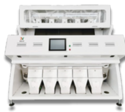
DCS - 5T