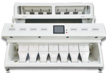
DCS - 7T