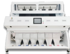
DCS - 6T