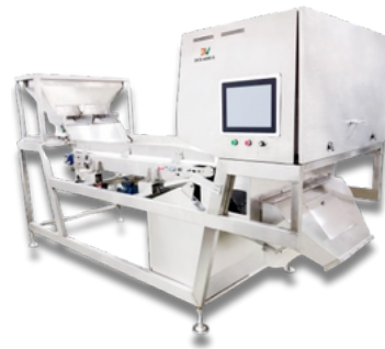
DCS - Belt Sorters

Enquire with us for your special sorting needs