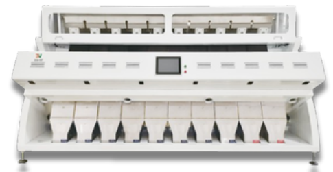
DCS - 10T