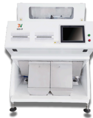
DCS - 2T